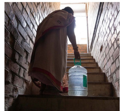
When the Water Runs Dry: Human Rights, Climate Change & Deepening Water Inequality in Delhi, India Harvard Law School International Human Rights Clinic Center for Economic and Social Rights